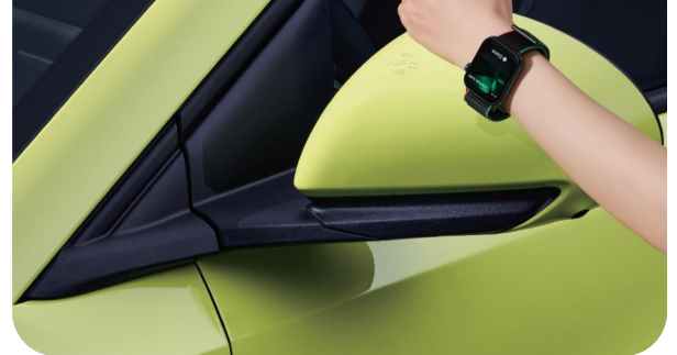
Easy access with NFC key