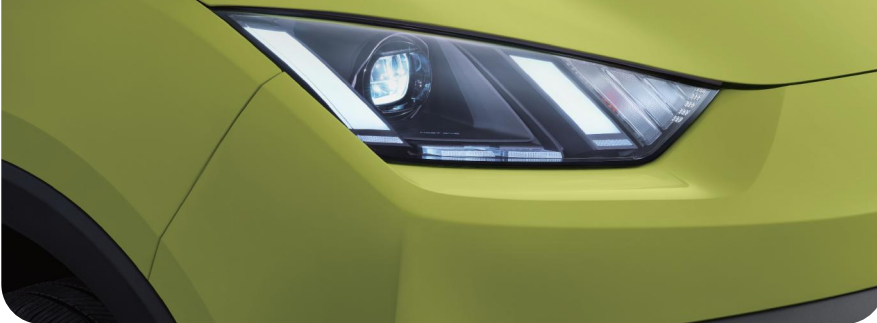
Sharp headlight design with standard DRLs