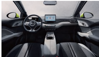
Black and grey